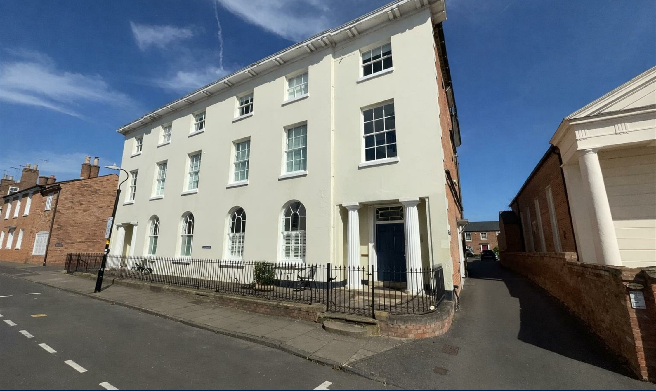
The Fold, Payton Street, Stratford-upon-Avon, CV37 6NJ